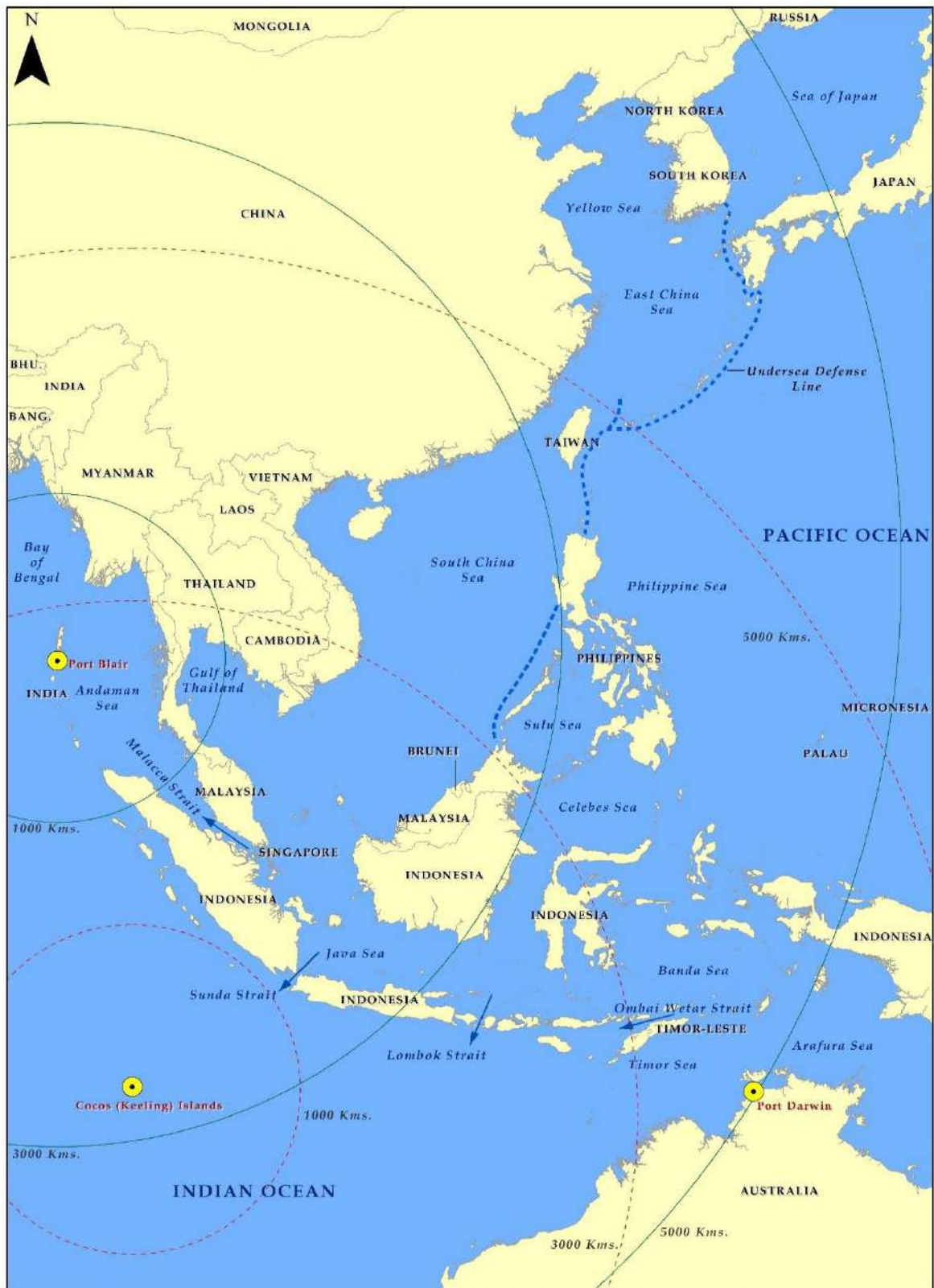
© Manohar Parrkar Institute for Defence Studies and Analyses, GIS Section. Map not to scale.