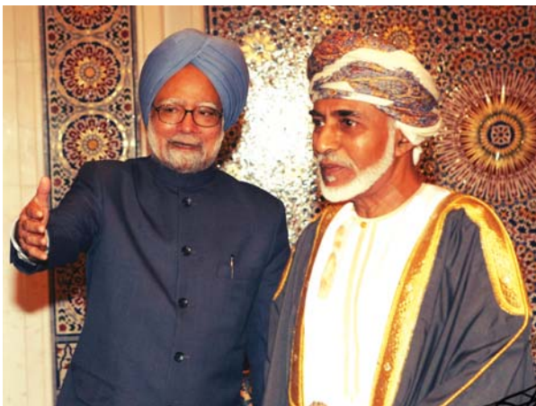
Dr. Manmohan Singh with the Sultan of Oman, Mr. Qaboos Bin Said Al-Said in Muscat on November 9, 2008.

On the economic side of things, India has the potential to play an important role in the