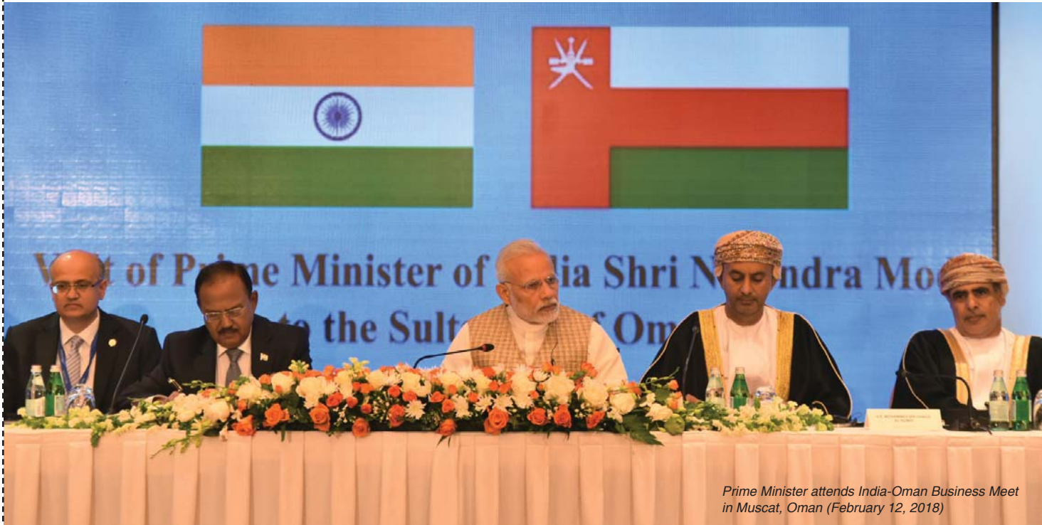
Prime Minister attends India-Oman Business Meet in Muscat, Oman (February 12, 2018)