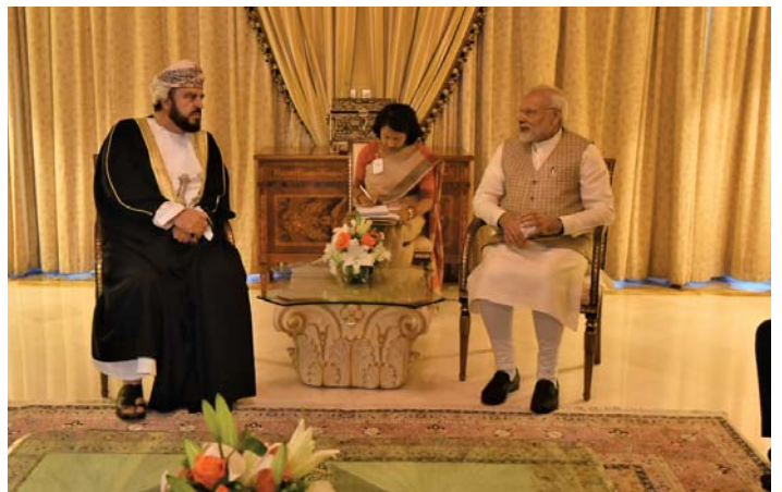
Prime Minister meets Sayyid Asa'ad bin Tariq Al Said, Deputy Prime Minister for International Relations and Cooperation Affairs of Oman in Muscat (February 12, 2018)