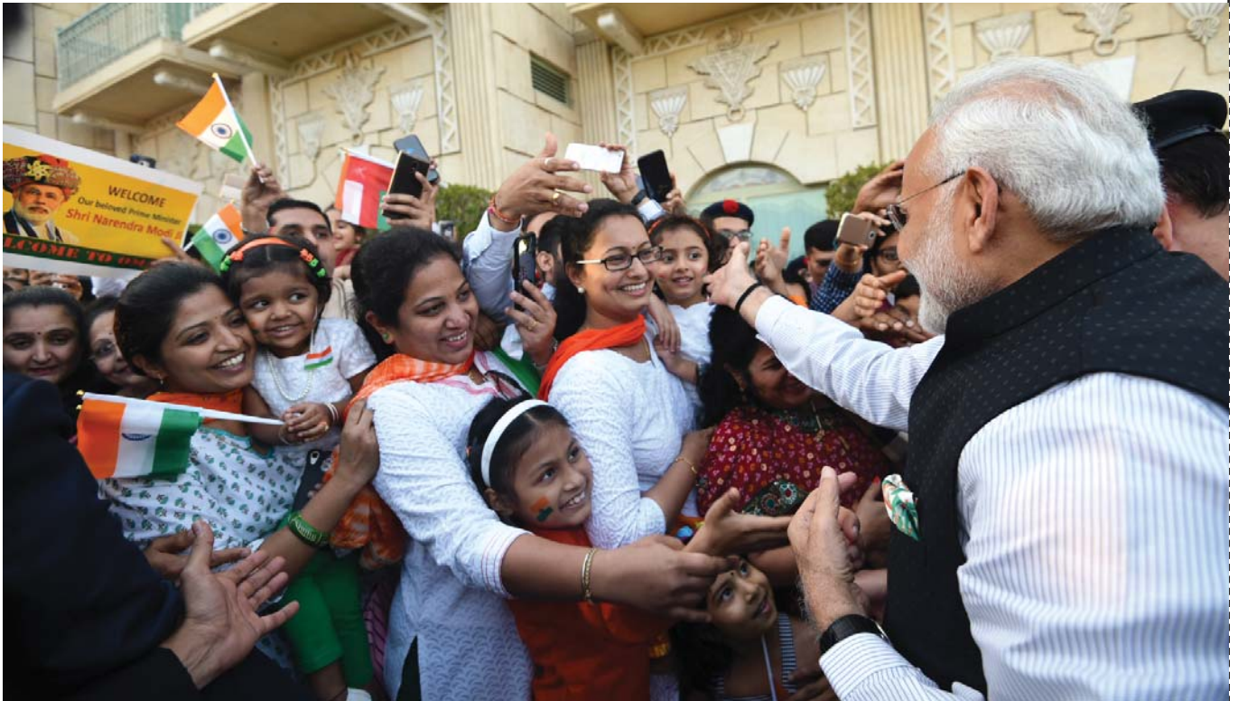
The Indian community enthusiastically welcomes the Prime Minister to Muscat, Oman on February 11, 2018.

in Mayo college in Ajmer, Rajasthan where two halls have been named in honour of Oman and our deep bond with the Omani people. Religious tolerance has been another hallmark of the India-Oman cultural friendship. Hindu temples were allowed to be built in Oman and, by the 1760s, there were four Hindu temples in Muscat alone. PM Modi paid a visit to the 125-year old Shiva temple situated in Muscat during his latest visit to Oman.