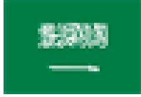
Adnan Gulshair el-Shukrijumah