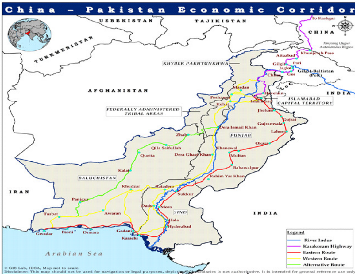
Map 2: CPEC and POK