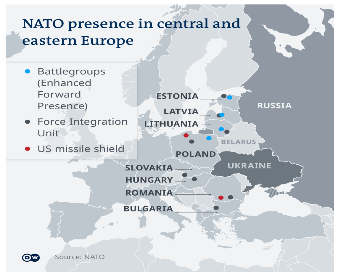
Fig. 1: NATO's Presence in Central and Eastern Europe

The situation in Eastern Europe remains tense. The United States (US), in its first major move since the escalation, has reinforced the defence posture on NATO's (North Atlantic Treaty Organization) eastern flank. Russia has accused the US and NATO of escalating tensions by deploying troops and weapons. This accusation has been rejected by the West citing Russia's first move of deploying a hundred thousand troops along its border with Ukraine, and continuing joint military drills in Belarus and troop deployments in Moldova, which triggered the West to keep up its preparedness (Fig. 1).