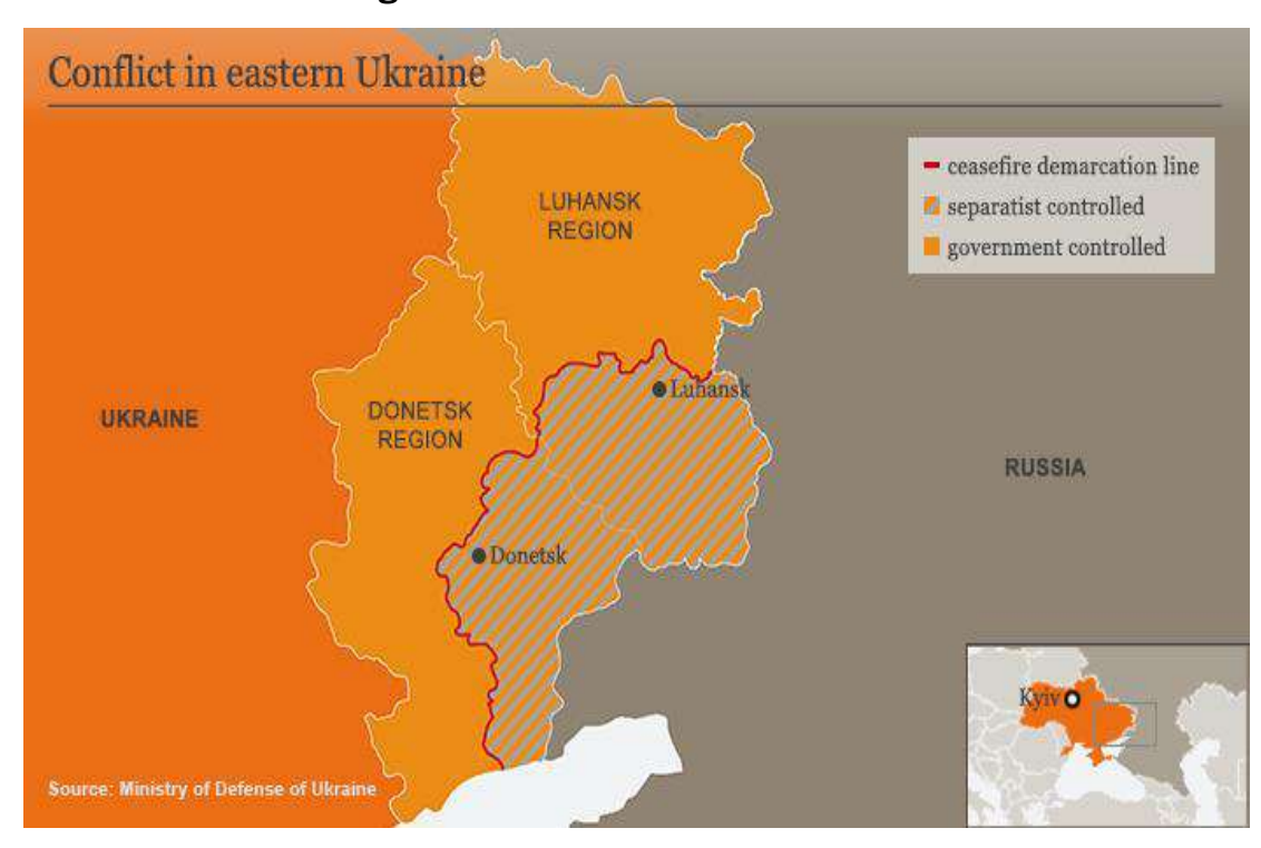
Fig. 2: Conflict in Eastern Ukraine

Hasty drafting and contradictory provisions rendered the Minsk-II agreement ineffective,<sup>21</sup> and Russia and Ukraine repeatedly accused each other of violating the terms of the agreement.<sup>22</sup> The most glaring weakness of Minsk-II is that it does not make Russia a direct party. Although signed by the Russian Ambassador to Ukraine, Mikhail Zurabov, the agreement does not mention Russia—an omission that Russia has used to evade responsibility for implementation and maintain itself as a disinterested arbiter.<sup>23</sup> Hence, in effect, it is only dealing with Ukraine and the separatists in the East thereby giving Russia the leeway to violate it citing technicalities.<sup>24</sup>