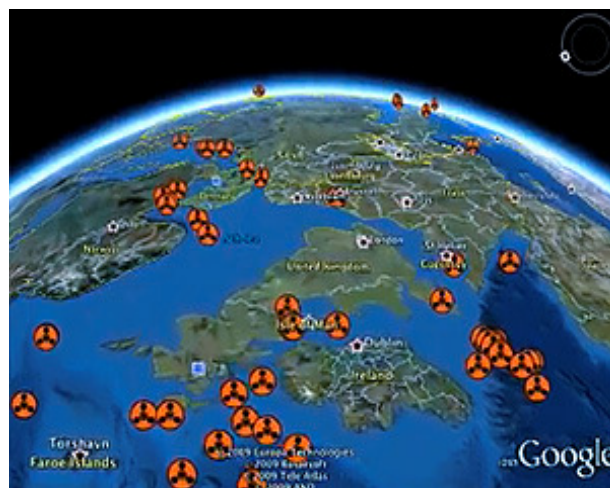
Estimated locations of the Chemical Weapons dumped at Sea. 3

The biggest questions associated with the issue relate to not only how to deal with the chemical weapons already dumped into the depths but also who should be responsible for the clean-up. As most of these weapons are dumped into waters outside territorial boundaries and borders, it presents a legal as well as logistical challenge in terms of safely salvaging and destroying them in a manner that they are no longer harmful to the environment or human health.